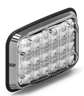
REVERSE LUX R-4600