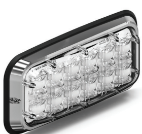
REVERSE LUX R-3700