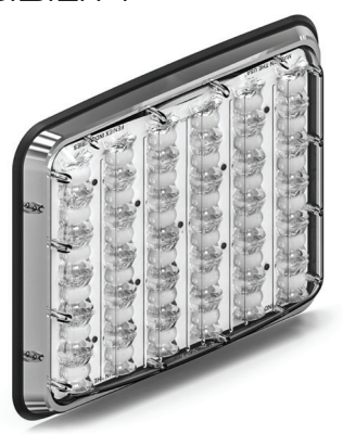
REVERSE LUX R-7900