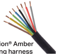
Fusion® Amber wiring harness