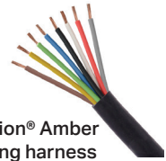
Fusion® Amber wiring harness